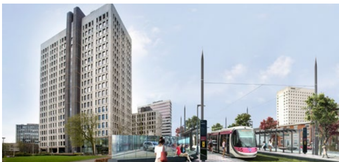
CGI of new proposed metro station

The building prominently fronts Hagley Road, one of the main arterial routes into Birmingham and benefits from being outside the Clean Air Zone. The building has excellent transport connections with Five Ways station a short walk away and one stop from Birmingham New Street. Hagley Road offers excellent links across Birmingham and beyond with the M5 and A38(M) just a short drive. This connectivity will be further improved with the forthcoming tram service which will see the terminal outside the entrance to 54 providing a 3.5 minute commute to Birmingham New Street.